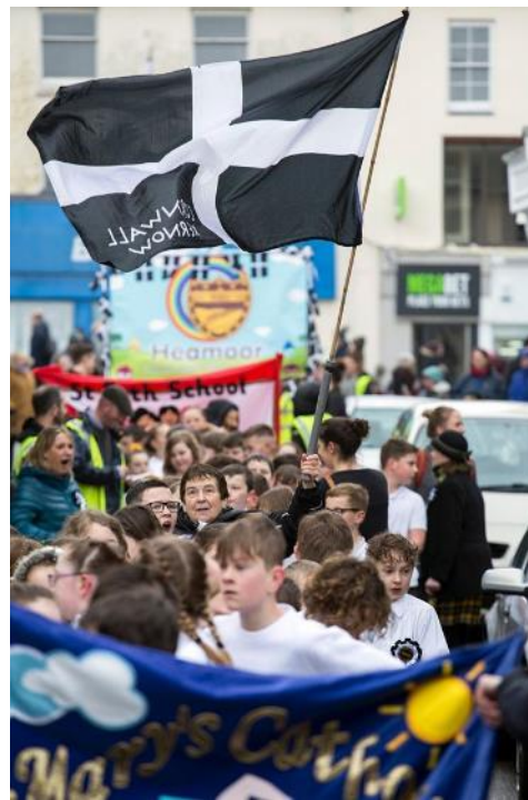
St Piran's Day Furry Procession 2020

Cornish culture – through song, music and dance. Our grant allowed the group to continue its St Piran Celebrations - including the annual St Piran Concert and Furry Procession.