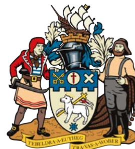
Penzance Coat of Arms