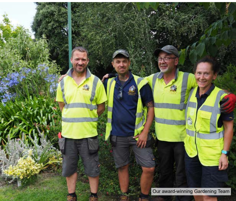
Our award-winning Gardening Team

PENLEE HOUSE — — — — — — — — — — Gallery & Museum