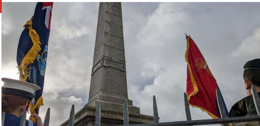
Sea and Army Cadet Standard Bearers at the Penzance War Memorial.