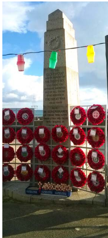
Mousehole War Memorial, Mousehole Harbour