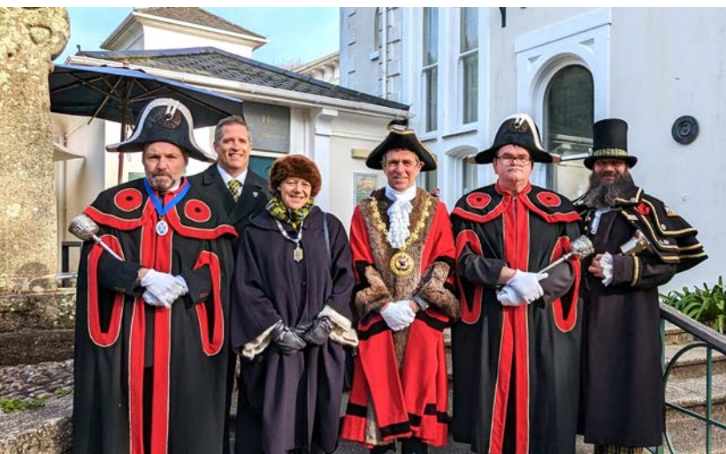
From left to right: Mace Bearer, Town Clerk, Mayor's Consort, Town Mayor, Mace Bearer, Town Crier

Penzance Council is represented on the Penzance Town Deal Board , Penzance Regeneration Company Board , Safer Penzance and works closely with the Penzance Business Improvement District (BID) to name a few.