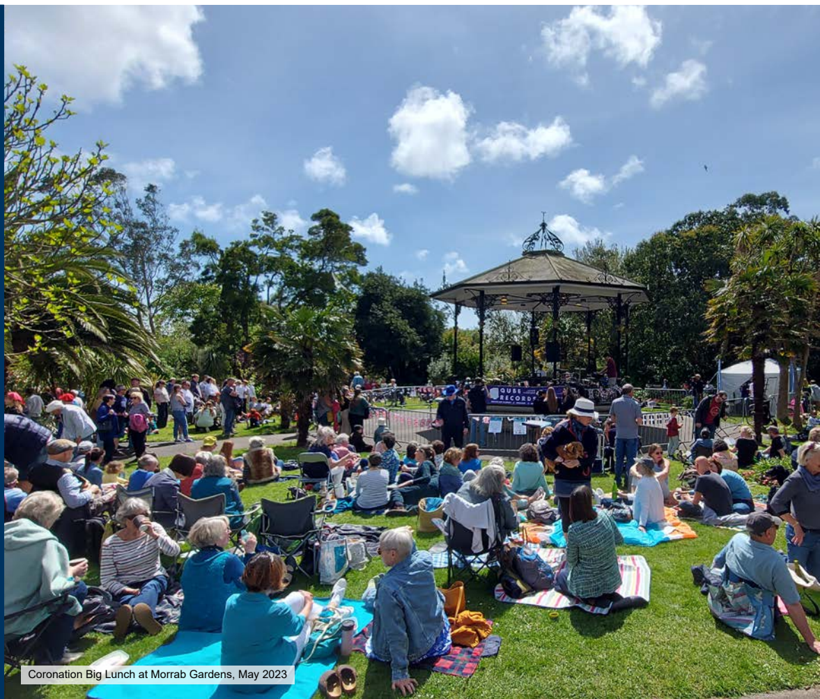
Coronation Big Lunch at Morrab Gardens, May 2023

To make the community (of Penzance Council) a better place to live, work and grow.