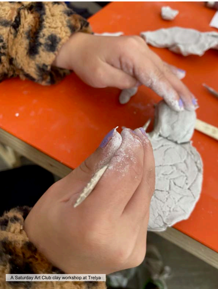
A Saturday Art Club clay workshop at Trelya

Penzance Parish Residents can gain free entry to Penlee House all year round on production of proof of address.