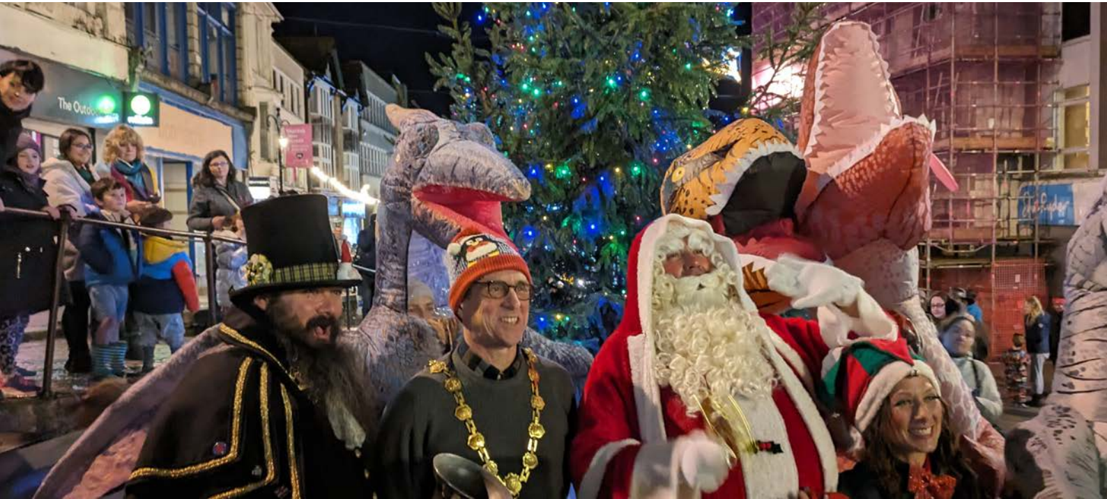
The 2023 Christmas Light Switch On in front of the Christmas Tree on Market Jew Street

We also provided grants to Heamoor CIO (£950) and Newlyn Harbour Lights (£6,000) to support their Christmas Light displays this year!