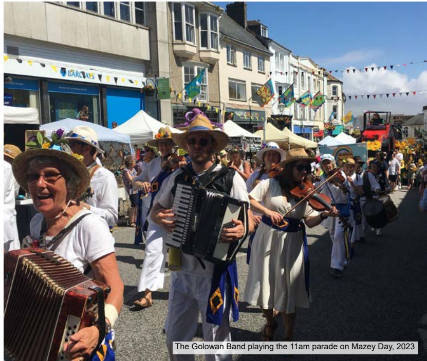
The Golowan Band playing the 11am parade on Mazey Day, 2023

ASB incidents should be reported directly to Devon and Cornwall Police by calling 101 or online: Report antisocial behaviour | Devon & Cornwall Police