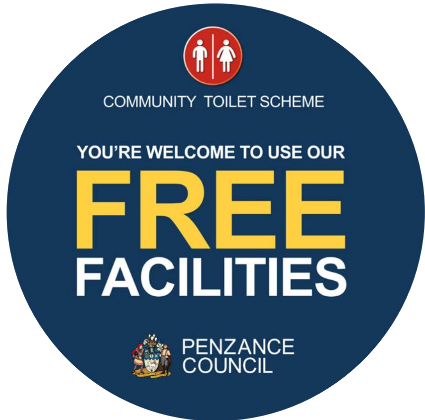
Penzance Community Toilet Scheme participating business sign

You can find out more about the community toilets, where they are and their opening times on our website: www.penzance-tc.gov.uk/community-toilet-scheme/