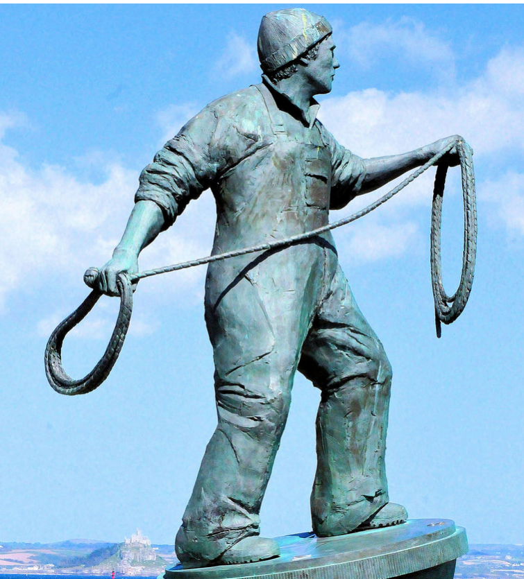
Fisherman Memorial, Newlyn Green

As part of our Climate Emergency Action Plan , we do not use any chemicals and the weeding is done using electric powered tools.