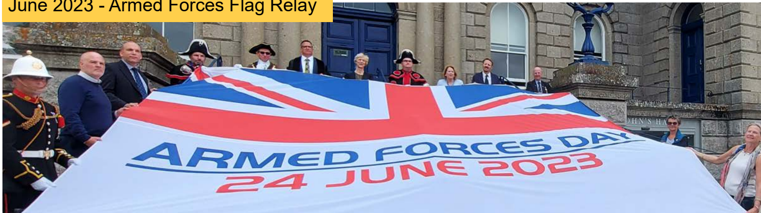
Veterans, dignitaries and local representatives hold the Armed Forces Day flag in front of St John's Hall