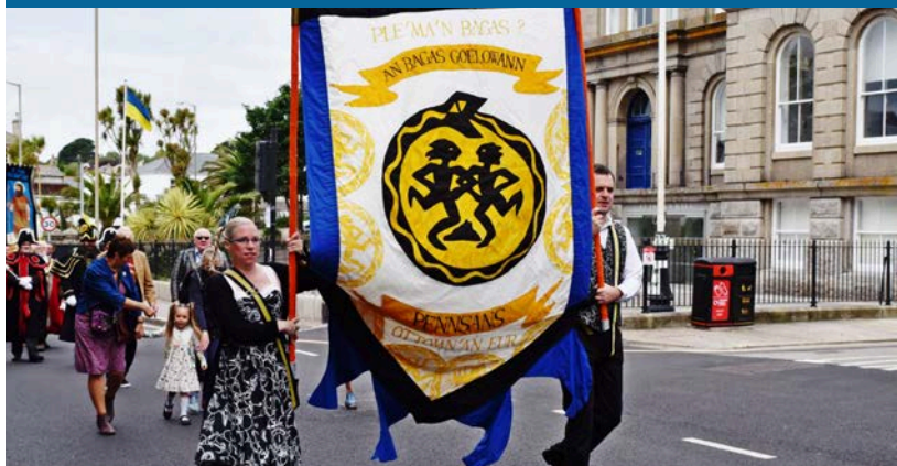
The Golowan Banner being carried at the start of the parade