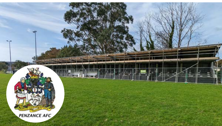
Start of the replacement roof works at Penzance Football Club - October 2023

Whilst the initial delivery of these important projects often receives the most attention, the Leisure and Amenities Committee and small in-house team of staff take pride in the high standards of maintenance and upkeep that we apply to our sites after projects have been completed. This means that they remain in better condition for longer for parish residents and visitors to the area.