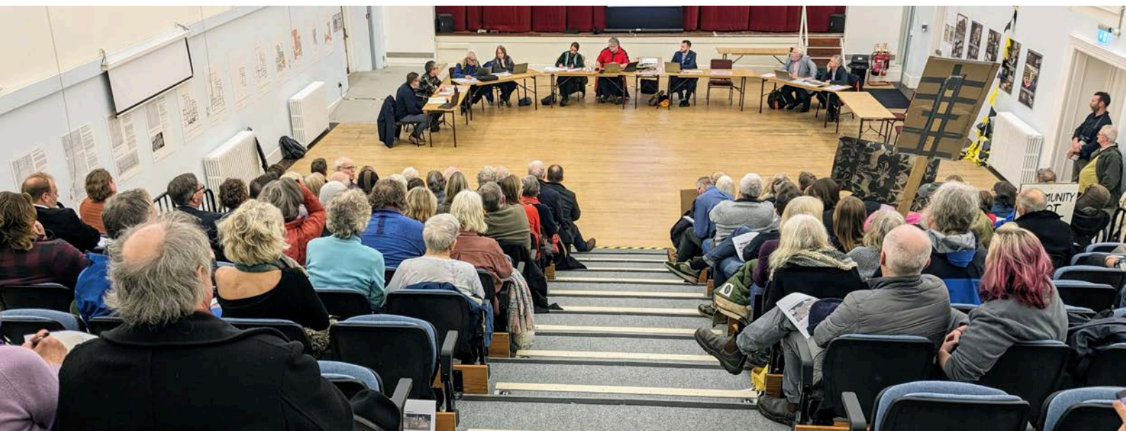
Local residents at the Planning Committee meeting where the Coinagehall development application was considered - Dec 2023

All members of the public are welcome to attend – you have the opportunity to comment on specific planning applications at the start of the meeting.